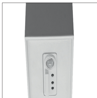
XC daylight&occ sensor

All current index numbers, lumen outputs, power consumption and many other technical information are available in our 2024 pricelist. Details on wireless lighting control systems on page number 896.